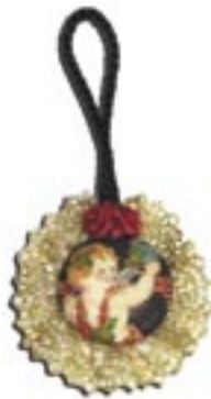
Printed fabric highlighted with paint gives the illusion of a hand-painted ornament.