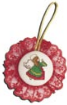
A small cross stitch design accented with ruffles is perfect for using leftover fabric and lace.