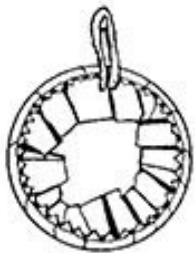
Figure 1: Attaching split rings to snap