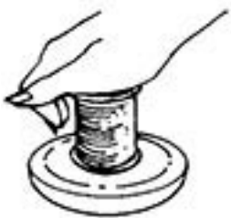
Figure 1: Attaching split rings to snap