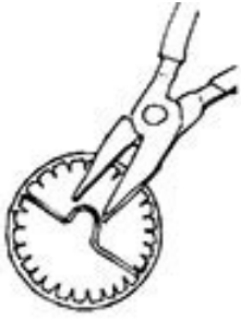
Figure 1: Attaching split rings to snap