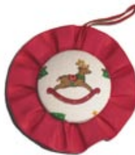
Center a design on any size button for a quick and easy gift or a tree decoration.