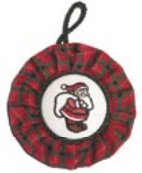
Use machine embroidery designs and cording to create a simple ornament or package topper.