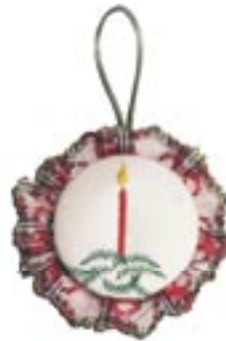
Use the built in stitches on a sewing machine to create an original design; then cover a button centering the motif.