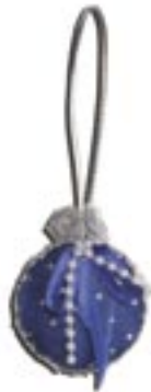
Glue two covered buttons together for an ornament that is suitable for use on all sides.