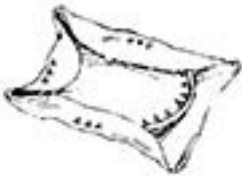
Figure 1: Attaching split rings to snap