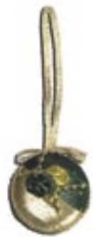
Use bits of ribbon and trim to create a two-toned button that not only uses scraps but creates a design uniquely your own.