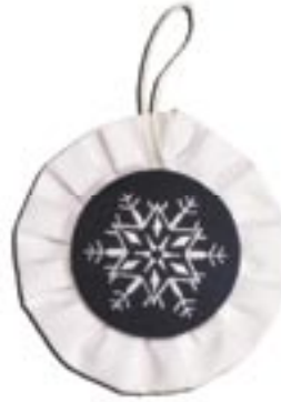
Snowflakes stitched on blue fabric carries a winter theme throughout the season.