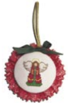
Cross stitch designs and a lace ruffle create a unique way to decorate any small space.